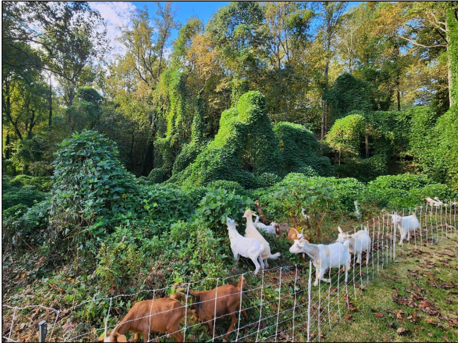
Goats consuming kudzu near Fry's Spring.

This year, we were updated on the research done at Ragged Mountain Reservoir to investigate the use of beneficial wasps to help control the emerald ash borer. This is a pest management approach known as biocontrol. In 2021 and 2022, researchers from the USDA Animal and Plant Health Inspection Service released beneficial wasps, capable of parasitizing the eggs of emerald ash borers. In October of 2023, they returned to gather samples from trees to evaluate the efficacy. The bark was removed by a USDA researcher, who will then analyze the sample looking for signs the EAB eggs have been parasitized by the beneficial wasp (results to be determined, and we will be informed of the results). Although a lot of damage has been done to the native ash tree population, this research may yield important scientific advances which may save other ash trees. The City will continue to cooperate with other agencies to work on projects like this.