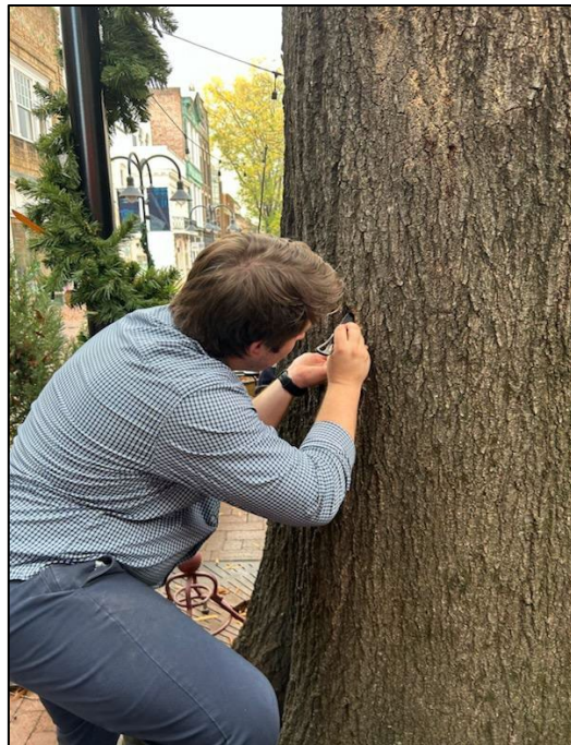
Entomologist from Bartlett Tree Experts