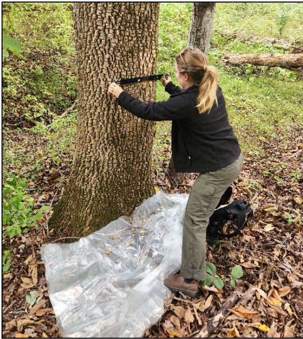
USDA staff sampling ash at Ragged Mountain