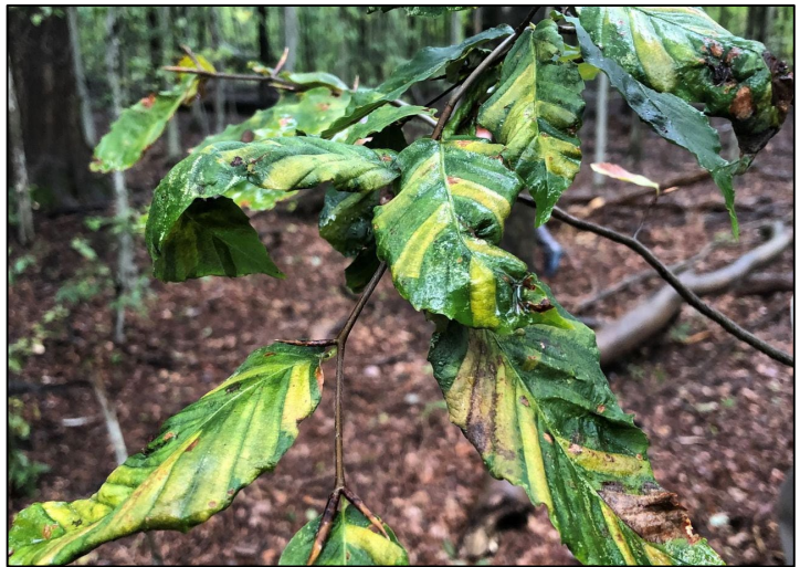
Beech Leaf Disease