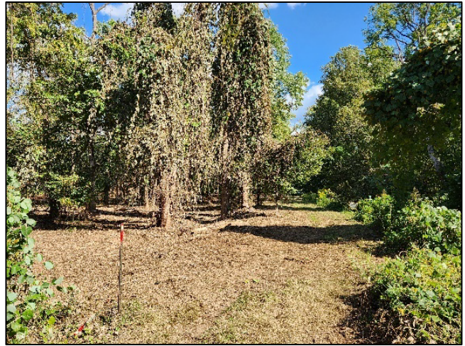
After forestry mulching. (same location)