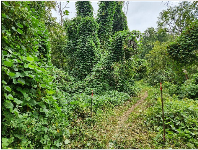
Before forestry mulching (near Jordan Park)